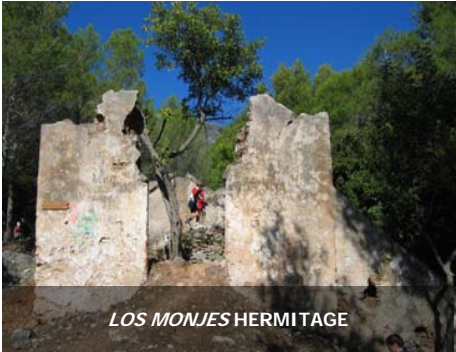
LOS MONJES HERMITAGE

Once you reach here, you can lengthen the walk if you have the energy, or you can return on the same path to La Fabriquilla.