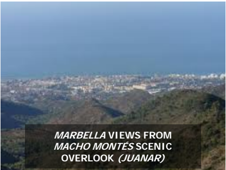
MARBELLA VIEWS FROM MACHO MONTES SCENIC OVERLOOK (JUANAR)

The ascent comes to an end at Puerto de Marbella (8) on the side of Pico Juanar. Here is the last signpost indicating the path to the right, towards the viewing point where the route ends.