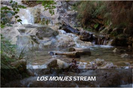
LOS MONJES STREAM