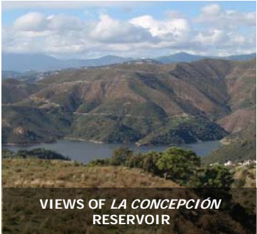
VIEWS OF LA CONCEPCIÓN RESERVOIR

From here you can continue on to Istan or return along the same path to Nagüeles.