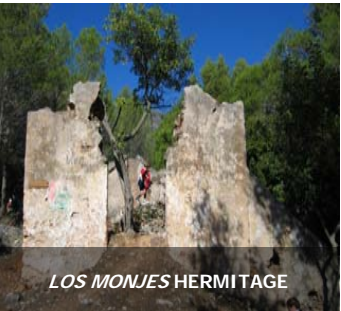
LOS MONJES HERMITAGE

You now come to a clearing where the path stays close to the stream and where there is another signpost (10) indicating the ascent to Puerto Juan Ruiz to the left (22) . Here there is a further signpost indicating the descending path towards Finca de Capellanía (21) . Once on the plain, you must turn left along the path that goes up to Montúa (30) and from there go down to the Puerto Rico Bajo car park where the trail ends (2) .