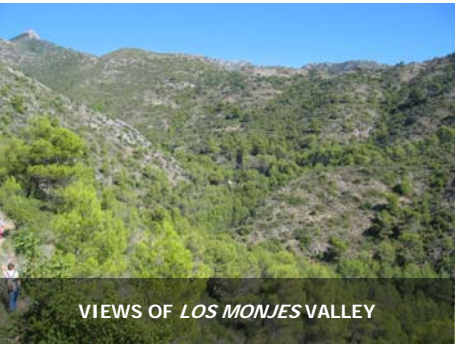
VIEWS OF LOS MONJES VALLEY