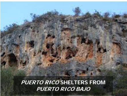
PUERTO RICO SHELTERS FROM PUERTO RICO BAJO

Continue descending Cañada de Santillana until arriving at the Montúa clearing, where you will find the last signpost (30) and from there descend towards the Puerto Rico Bajo car park where the path ends (2) .